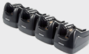
▪ 94A150037 4-Slot Charging Dock ▪ 94A150038 4-Slot Ethernet Dock