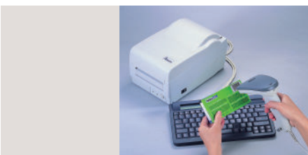
> Standalone mode with Argoclient