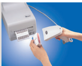
> Standalone mode with scanner